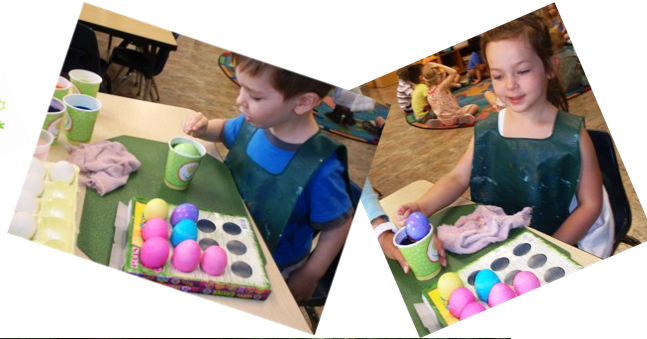
Having a blast dying eggs!!