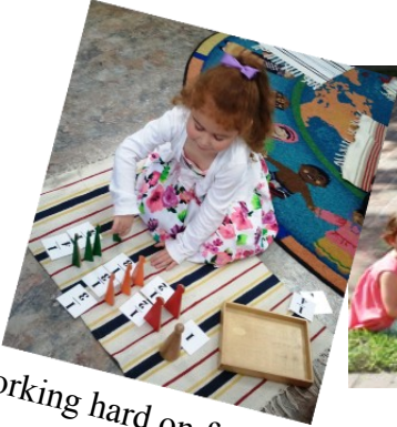
Working hard on fraction skittles