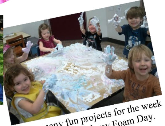
One of the many fun projects for the week of the young child. Messy Foam Day. We loved it!