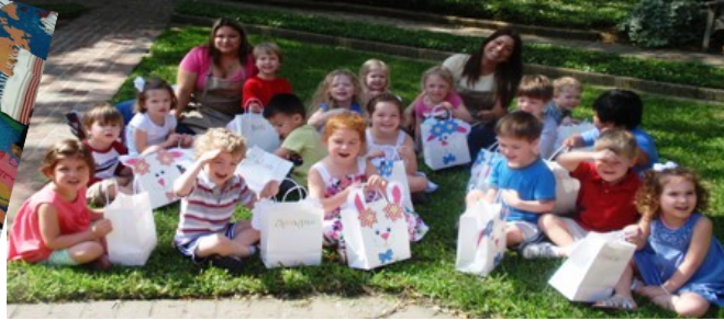
Enjoying our bountiful treats!